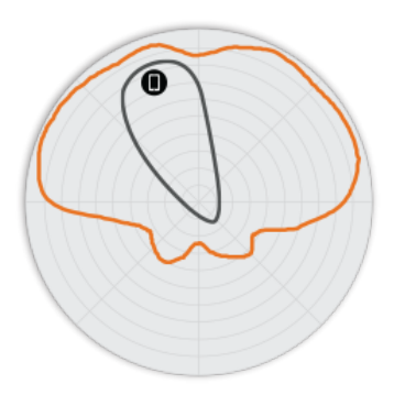
Figure 4. R750 2.4GHz Elevation Antenna Patterns