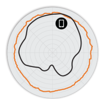
Figure 2. R750 2.4GHz AzimuthAntenna Patterns