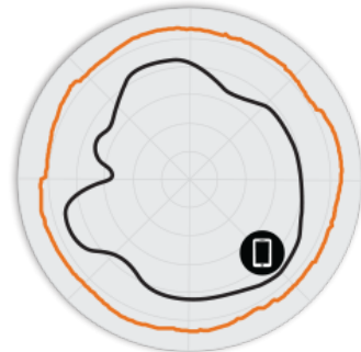
Figure 3. R750 5GHz AzimuthAntenna Patterns